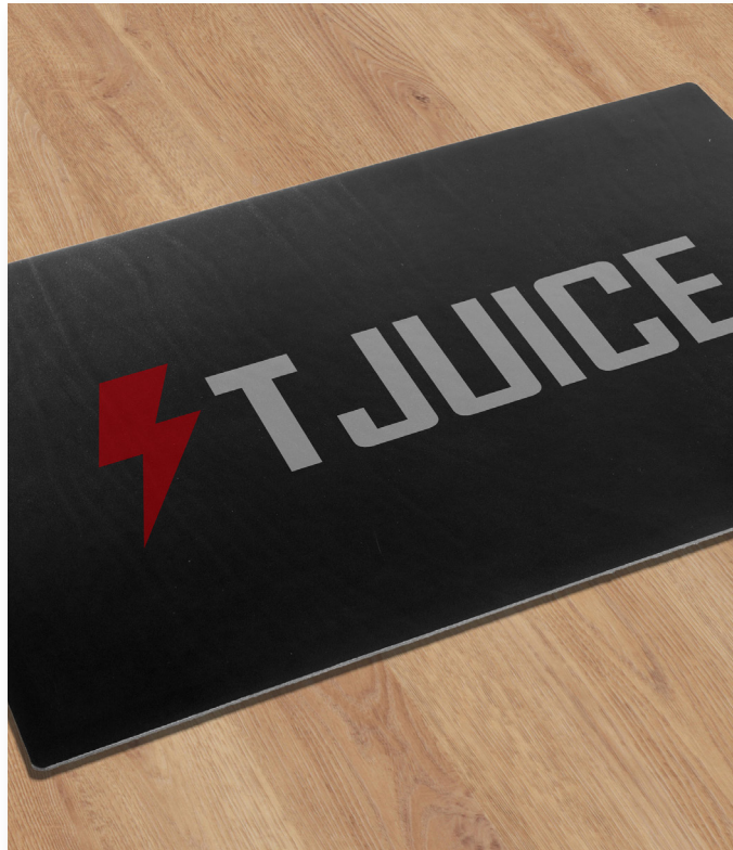
SOFT COUNTER MAT